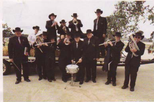
Ararat Show 2007

Ararat City Band acknowledges the support of: